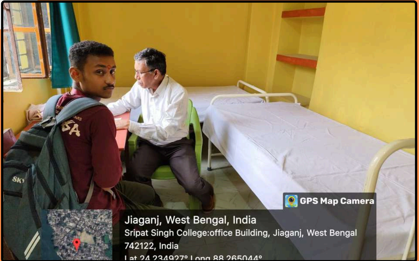
Glimpse of a moment