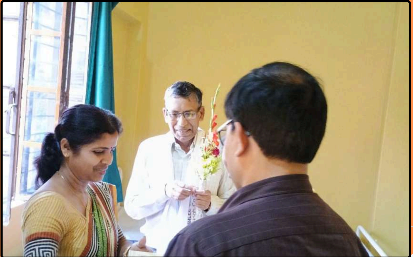
Glimpse of a moment