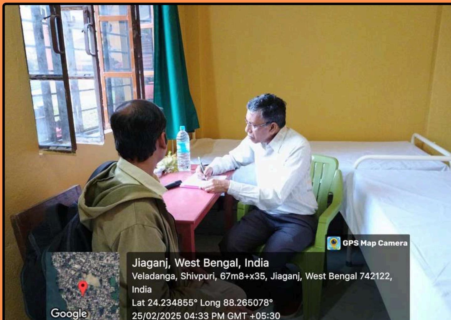
Glimpse of a moment