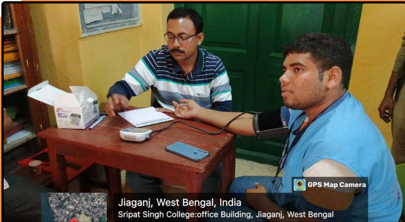
Glimpse of a moment